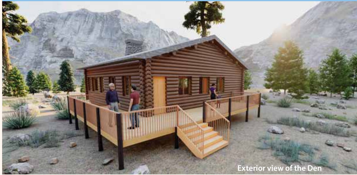
Exterior view of the Den