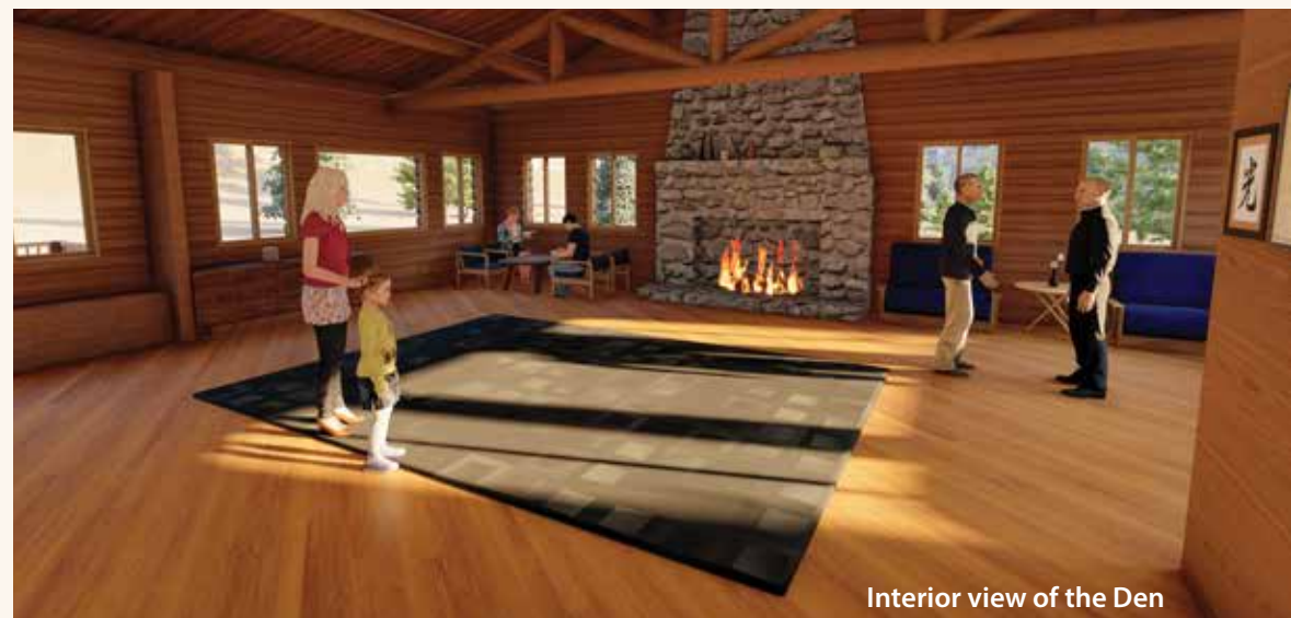
Interior view of the Den